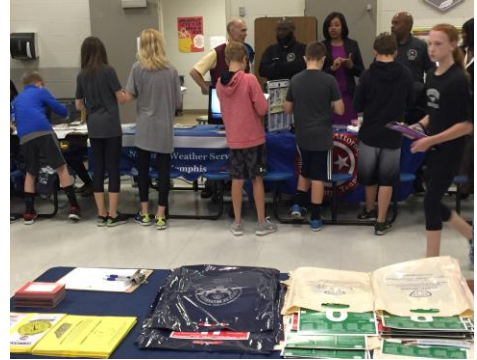
Caption: Students visit The SCOP table

On May 12, the Shelby County Office of Preparedness (SCOP) attended Germantown’s Houston Middle School’s annual “Career Day” to meet the students and share information about emergency management careers. Students asked questions as, “Why did you choose this career?” “What skills and education do you need to do your job?” and “Would you choose this career again?” Inside the gym students visited with representatives from the National Weather Service, the Southern College of Optometry, Methodist LeBonheur HealthCare, University of Memphis, Germantown Police Department, United States Postal Service, Daybreak, Tennessee Environmental Conservation, Mid-South Solutions, Toyos Clinic, Federal Drug Administration, Shelby County District Attorney, Solid Waste Management, and International Paper. Outside, the school set up an emergency vehicle demonstration for students.