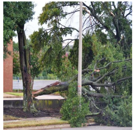
Photo Captions: Left: MLGW repairing a broken utility pole, Middle: Signal light out on Jackson Avenue. Right: Downed tree at Yale and Covington Pike during morning rush hour traffic.