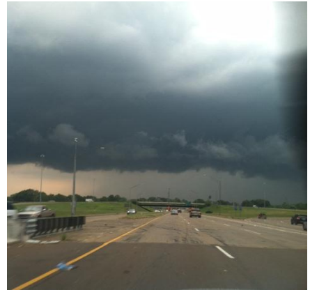
Photo Captions: August 5 severe thunderstorm: Left: wind and rain on Austin Peay, Middle: signal light out on Poplar Avenue backing up traffic, Right: low-hanging clouds on I40