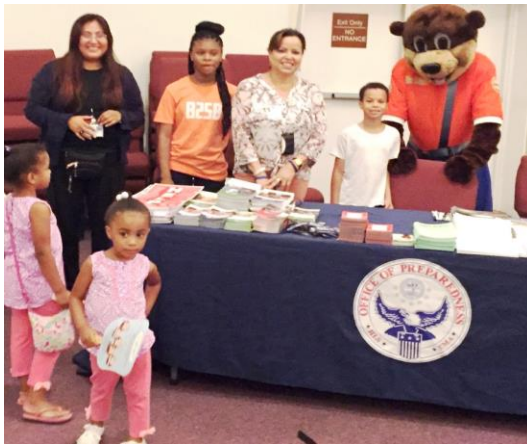
Caption: Families picked up preparedness literature at the New Dimensions Health Fair

The Shelby County Office of Preparedness was excited to participate in the New Dimensions Health Fair on July 30 at 3607 Frayser-Raleigh Road. Attendees picked up bags of preparedness brochures, coloring books, pens, HELP/OK signs, shelter-in-place information, and refrigerator magnets for emergency contacts. Also attending this fun event were the U.T. Dentistry College, Methodist Congregational Network, Kroger's, U.T. Academy of Student Pharmacists, Shelby County Public Health, CATS, TN Care Community Outreach, and Sisters Network Outreach Program.