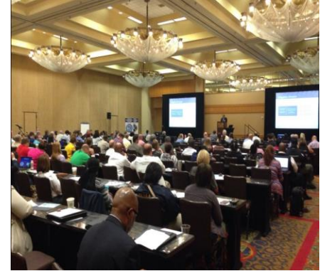
Caption: Attendees at the “Partners in Mitigation and Grants” workshop.