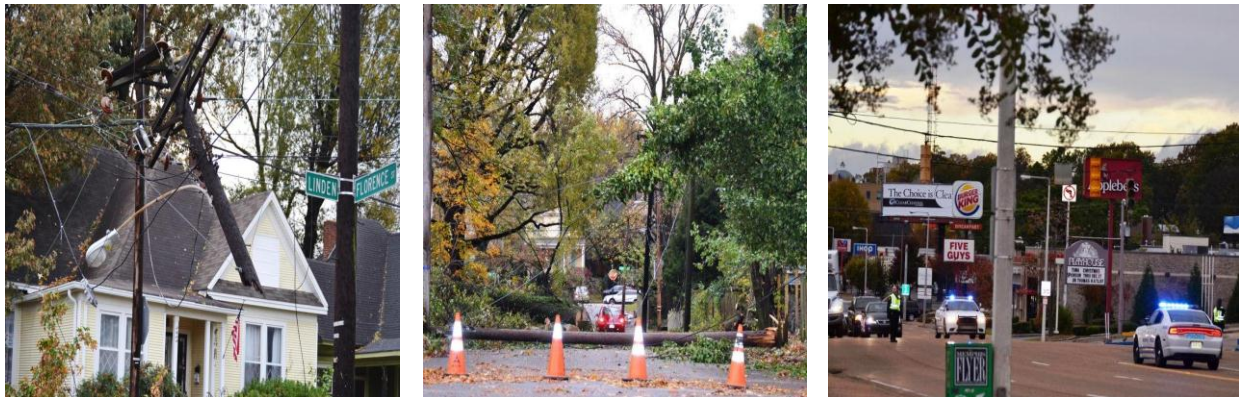
Photo Captions: Left: A broken utility pole dangles from electrical wires at Linden and Florence, Midtown. Center: Downed trees and utility poles block the street on Florence. Right: Law enforcement directs traffic on Union and Cooper due to signal light malfunctions.

Minor storm damage included downed trees and power lines, a few temporary road closures, and signal light malfunctions in Midtown, South Memphis, Whitehaven, Germantown, and Bartlett. By Wednesday, November 18, only 3,428 customers were without power by 8:30 a.m.