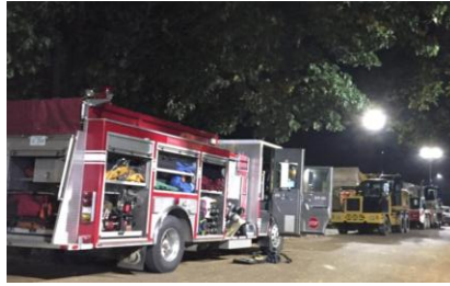
Photo Caption: Emergency equipment display at 1075 Mullins Station Road

Citizens attending the Shelby County Government Citizens University were welcomed to the Emergency Operations Center at 1075 Mullins Station Road on October 29, 2015 as part of their 12-week course. Students toured emergency equipment outdoors during the evening class.